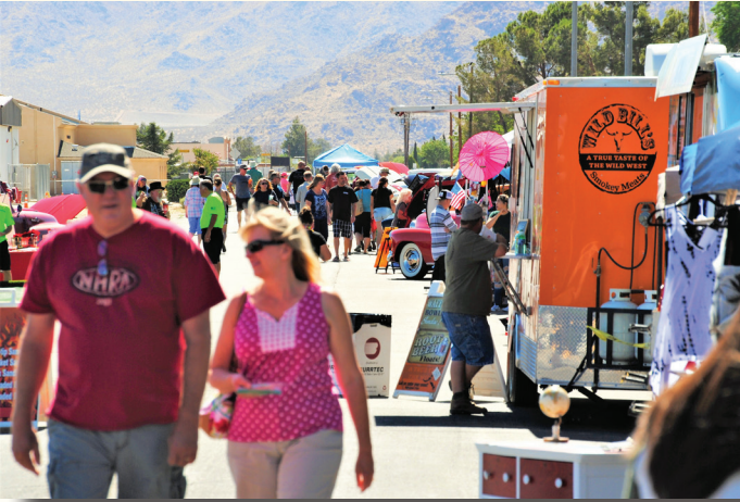
Summer Street Fair Saturday, June 27th 2020