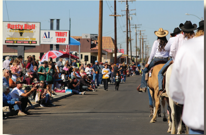
Happy Trails Parade & Street Fair Saturday, October 10th 2020