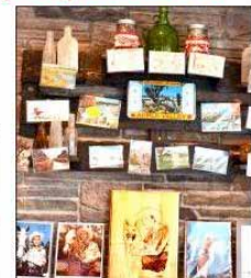
Roy Rogers photos, A.V. Ranchos post cards