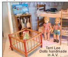
Terri Lee Dolls handmade in A.V.