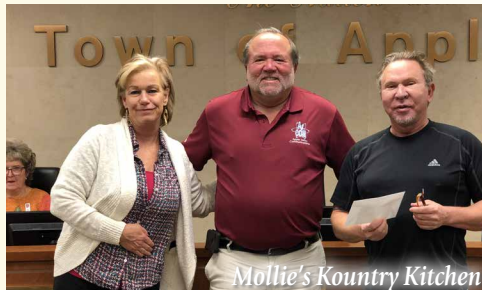
Mollie's Kountry Kitchen

Best Theme Decoration Apple Valley Mobile Home Lodge