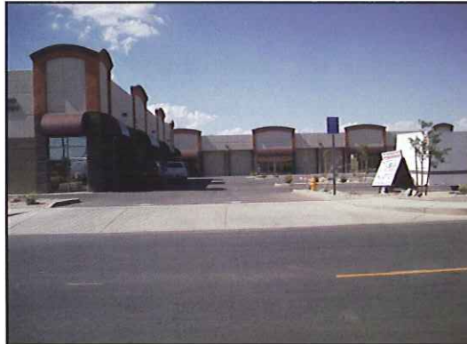
New development continues in the Village, providing great opportunities for businesses to locate.